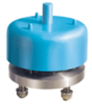
Pressure Relief Valve.