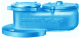
Vacuum Relief Valve.