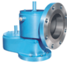
Breather Valve with Pipe Away.