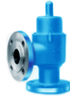
Pressure Relief Valve with Pipe Away.